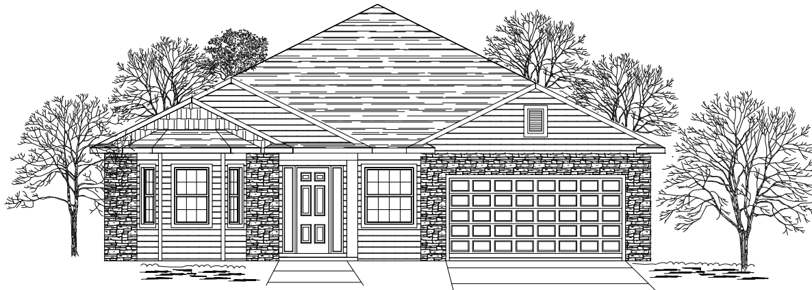
The Emerald Model 3 Bedroom, 2 Bath Den, 2 Car Garage